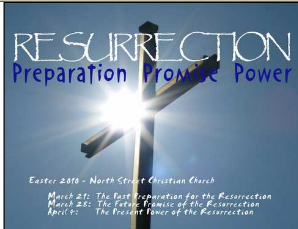
Easter 2010 - North Street Christian Church March 21: The Past Preparation for the Resurrection March 28: The Future Promise of the Resurrection April 4: The Present Power of the Resurrection

There will be NO WEDNESDAY NIGHT ACTIVITIES this week and the Church Office will be closed. on Monday, April 5th.